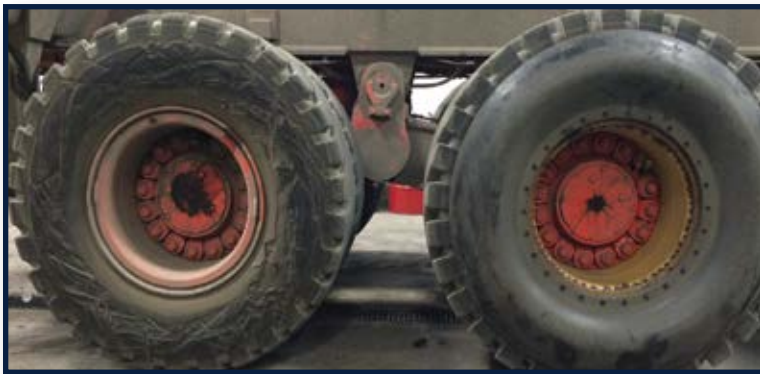
Protect tire sidewalls with the Hutchinson Tire Saver Shield™