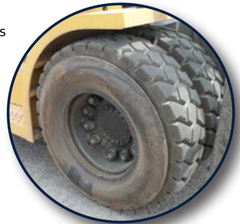
The Tire Saver Shield™ protects the highly stressed tire sidewalls on industrial vehicles.