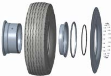
The Tire Saver Shield™ is compatible with all-wheel types including bolt-together, single-piece, and demountable (lock ring) wheels.