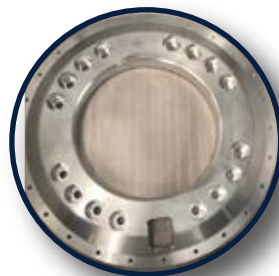
The Tire Saver Shield™ can be mounted to a Lug Protector.